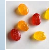
Oval shape candy