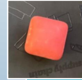
Square shape gum