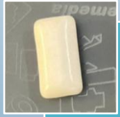
Rectangular shape gum