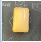
Rectangular shape gum