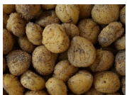
Salt and pepper