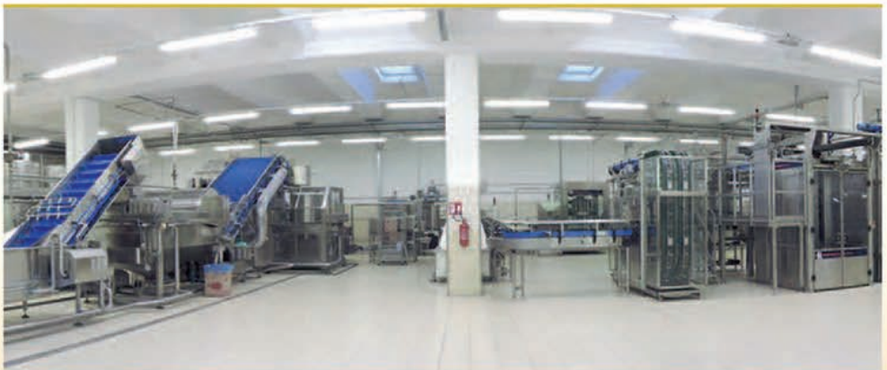
The new production line of the Preserves with a capacity of 10.000 jars/hours

of the modern and traditional trade, in Italy and abroad, Frantoio Venturino operates on an area of 23.000 square meters of which 3.200 covered, through the oil mill, 3 bottling lines and 2 preserves production lines (olives, pesto, pasta sauces, Ligurian traditional sauces, pate...) all supported by 60 hectares of olive trees grove of family Venturino's sole property. Venturino Family, by now at the third generation, enriches with new passion their history with a constant process of modernisation of the firm structure without losing sight of their own original traditions.