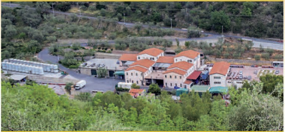
Frantoio Venturino Bartolomeo

Since 1946 Venturino family have been producing extra virgin olive oil. The factory was born and still operates in the wonderful Dianese valley, in the western part of Liguria Region also known as Riviera of flowers. Its microclimate has helped to make the western part of Liguria a land rich of very high-quality gastronomic products, beginning from Taggiasca quality olive and Genoese basil PDO (Protected Designation of Origin), ingredients that are the bases of Frantoio Venturino's offer. Manufacture of Ligurian alimentary specialty and main partner